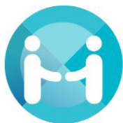
2. Partnering with Consumers