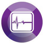
8. Recognising and Responding to Acute Deterioration