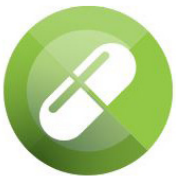
4. Medication Safety