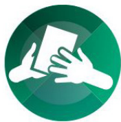
6. Communicating for Safety