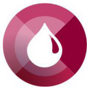
7. Blood Management