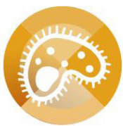
3. Preventing and Controlling Healthcare-Associated Infection