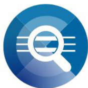
1. Clinical Governance

How we govern the health service (Standard 1, Governance) and how we partner with our consumers (Standard 2, Partnering with Consumers) underpins the principles of the other six clinical standards.