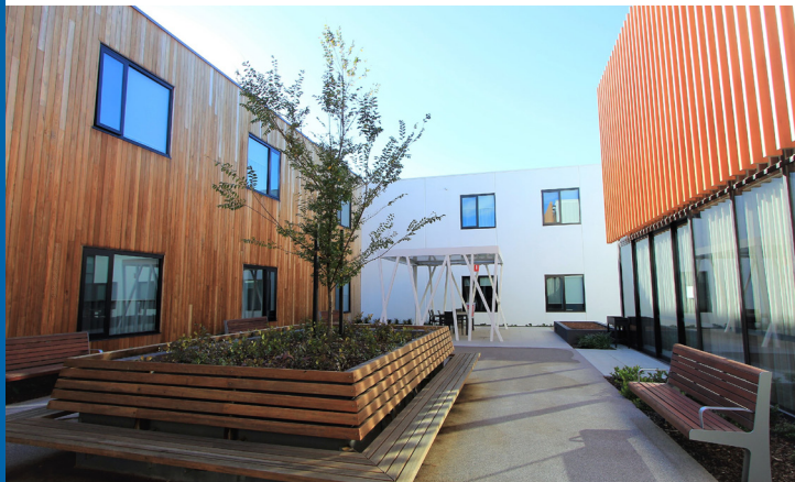
Courtyard space at Epping Gardens