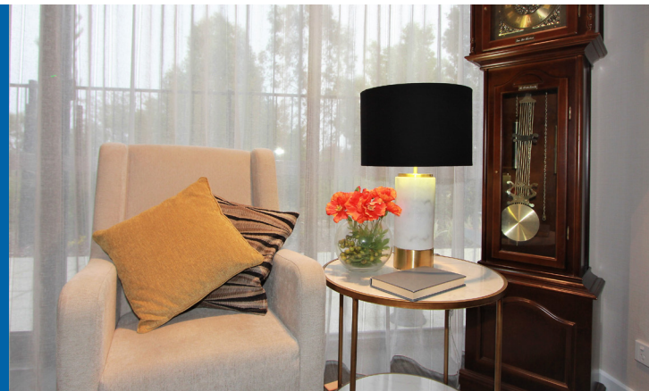
Patient and family lounge in Palliative Care Unit

You are welcome to discuss any questions or concerns with a member of our team.